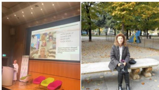
The activists spoke of their search for effective chronic UTI treatments

Patients-turned-campaigners tell landmark conference about the realities of living with a debilitating and painful infection